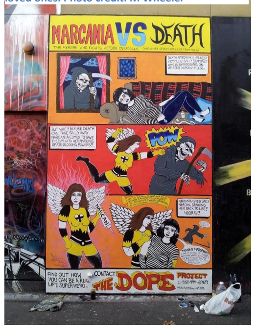
Public art installation by Mission Minicomix and Clarion Alley Mural Project: a collaboration to raise awareness and make referrals to the DOPE (Drug Overdose Prevention and Education) Project in the Bay Area of San Francisco.