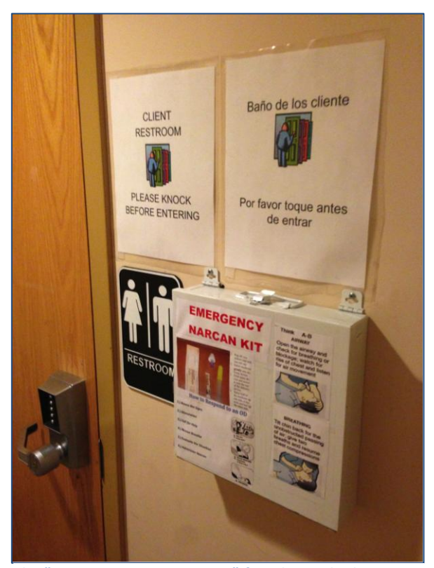
The "EMERGENCY NARCAN KIT" found outside the Boston Public Health Commission's substance use disorder treatment services sends the message that they are aware of the risk for overdose, are prepared to help people survive them, and the BPHC wants people alive to keep coming back.

among opioid addicted clients. However, the half-life is highly variable and risk of over sedation and overdose increases during changes in dosing (such as during methadone induction or discharge) or when combining with other sedating substances e.g. benzodiazepines or alcohol.