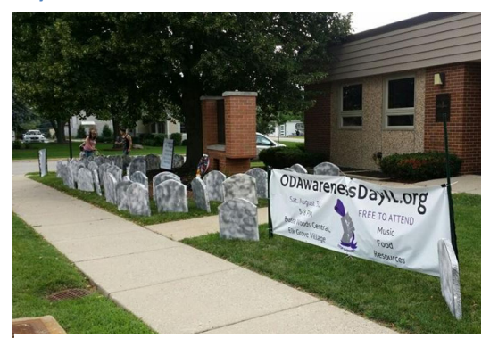
The Wauconda, IL Fire Department partnered with local prevention, treatment and advocacy organizations to make a dramatic statement about the prevalence of overdose in the area.

We need to create a safe environment where grief, regret, and trauma related to overdose can be expressed and addressed. Because there are some many different groups, organizations, and stakeholders, who may provide this support and where it is provided is expanded.